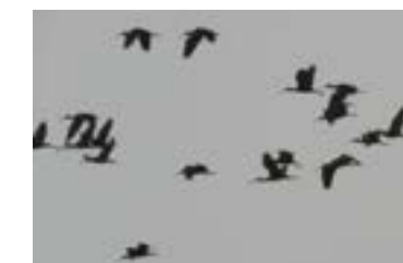
Fig.1: A migrating 'wedge' of ibis flies past the Gorman Hills.

A major bird event has just occurred in our mountains. This is the annual movement of many water bird species from warm equatorial regions south of us to lakes, marshes and tundra further north (Fig. 1). These species have evolved the strategy of