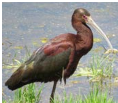
Fig. 9: This white-faced ibis is refreshing at the pond.