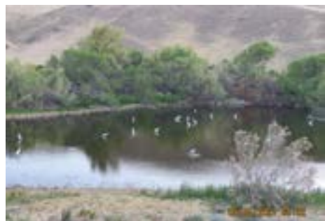
Fig. 2: Gorman Sag Pond sits beneath the Gorman Hills.

'NATURE' Continued from page 1 mallard ducks arrive (Fig. 3). Most will stay for a while, then move on northward. If the ducks ascertain the water will last long enough, one or two pairs will stay to nest (Fig. 4). With enough water present to provide safety from predators, they will produce fine families of ducklings (Fig. 5).