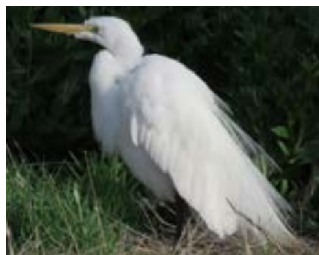
Fig. 8: There is plenty of food for this hungry egret.

the potential for residential and commercial development. The Buchroeders' photo records will be an important tool for assessing the environmental value of this area in the future.