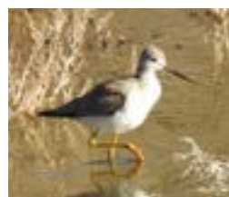
Fig. 10: The greater yellowlegs is an aptly named sandpiper.