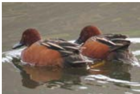
Fig. 6: These two male cinnamon teal will continue northward.

The Gorman Sag Pond is on private property and must not be disturbed or en-