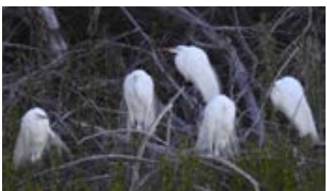
Fig. 7: April and May are the main arrival months for great egrets.

tered. There is a pull-out at the edge of the road where the pond may be observed. The pond, adjacent wetlands and the Gorman Hills are all on private property with