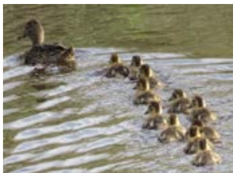
Fig. 5: The mallard brood is doing just fine.

Several shorebirds, including sandpipers, plovers, snipe, avocets, stilts and dowitchers have been documented here by the Buchroeders. The greater yellowlegs (Fig.