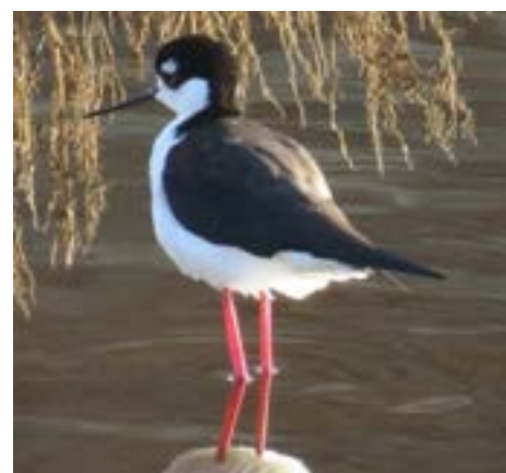
Fig. 11: The black-necked stilt uses its bill as a scythe for feeding.