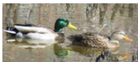
Fig. 4: This pair of mallards decided to stay and raise a family.

A spectacular event at the pond is the arrival of many great egrets during the spring (Fig. 7). These majestic wading birds stalk small animals both in the water and on nearby hills (Fig. 8). Six other species of herons and egrets visit this watering hole on their way north. The related white-faced ibis lend their exotic appearance to the feeding frenzy (Fig. 9).