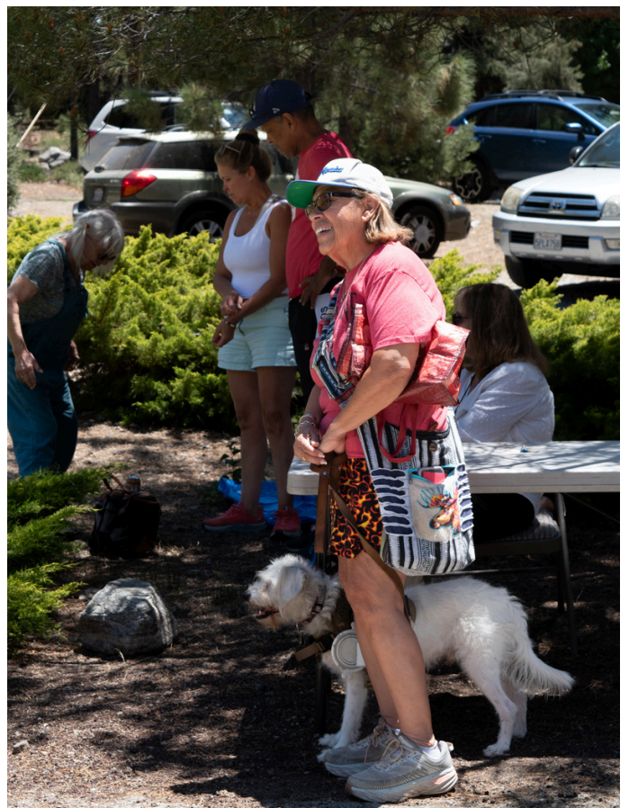
Residents gather before the food distribution