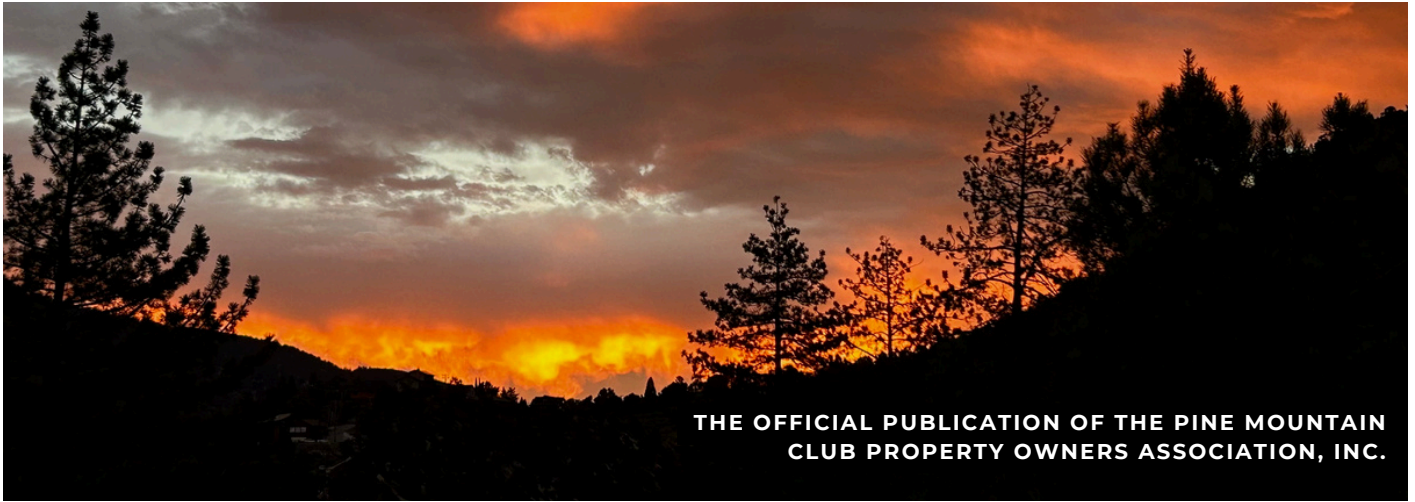
THE OFFICIAL PUBLICATION OF THE PINE MOUNTAIN CLUB PROPERTY OWNERS ASSOCIATION, INC.