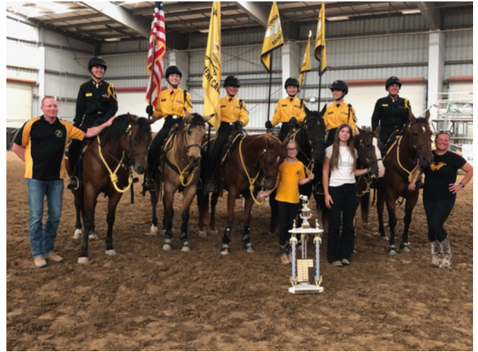
2024 State Grand Championships

We're so grateful to our community for coming together and celebrating with us. We can't wait to see you all at our Halloween Barn Bash coming up soon!